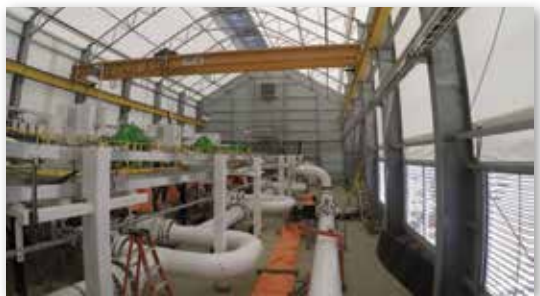
Designed to accommodate an integrated 15-tonne bridge crane