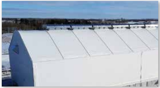
Six ridge vents (6'W x 12.5'L each) per building exhausts heat generated from the pumps