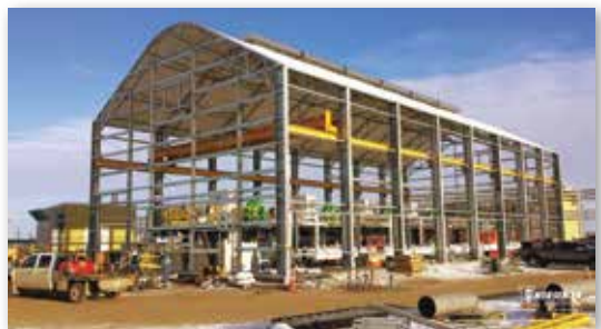
33' high steel side walls