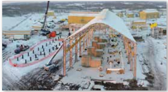
Buildings were erected overtop of the existing pumps